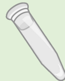
Urine taken in the morning

How about your belongings and clothes for the day?