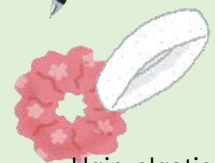
Hair elastic (for long hair)

Please print it out A4 size from the website of the Health Center and fill it out.