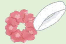
Hair elastic (for long hair)

Please print it out A4 size from the website of the Health Center and fill it out.